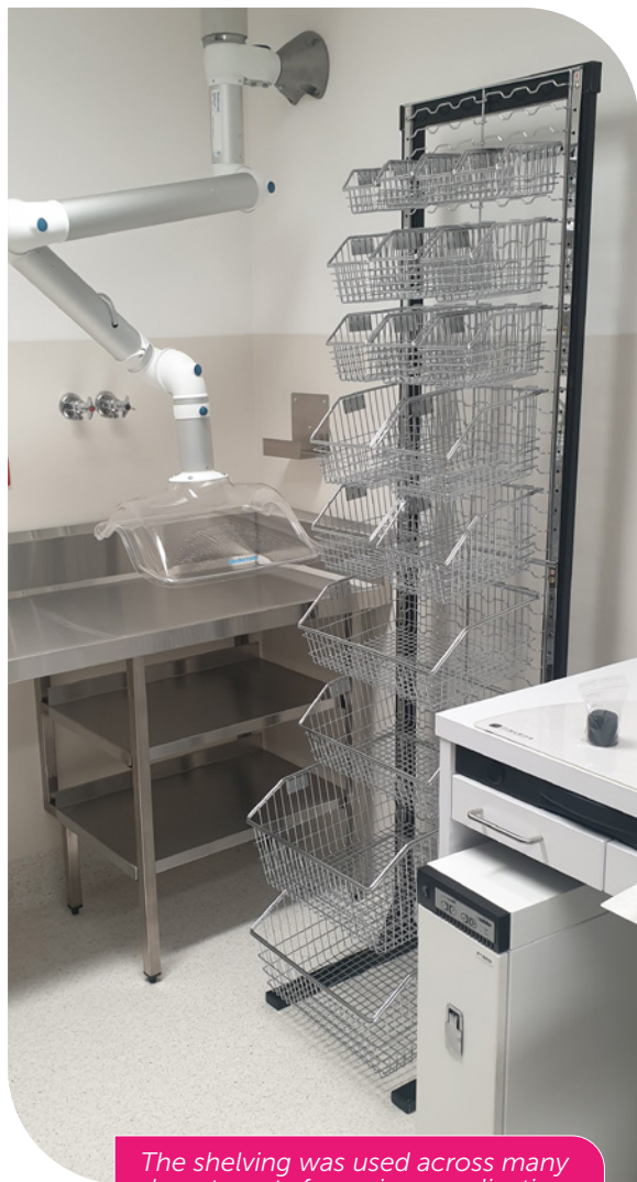
The shelving was used across many departments for various applications.

Challenges faced involved a small-time frame and tight budget constraints all at the construction site. They didn't require wire bin panels mounted in the hospital until they were sure it would work for them once they were operational. ■