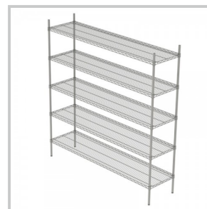
460mm or 610mm D x 1830mm W x 1800mm H