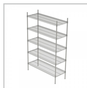
460mm or 610mm D x 1215mm W x 1800mm H