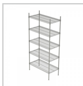
460mm or 610mm D x 915mm W x 1800mm H