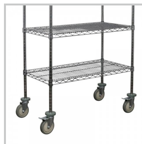
Wheels and bumpers