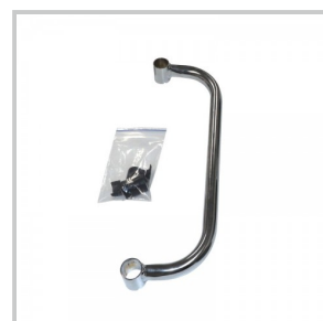
Push handle option