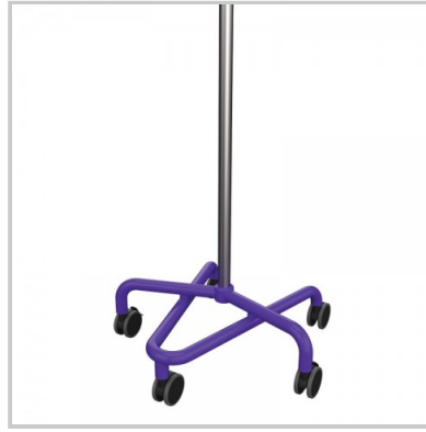
IV Coloured Bases