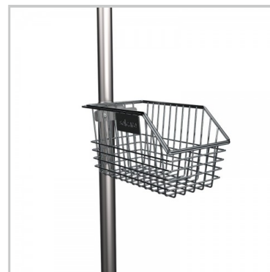
IV Storage Basket