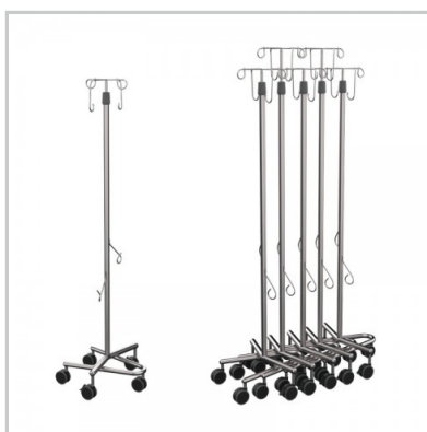
Stacking IV Poles

Browse our list of unique clinical products for all areas of the healthcare industry. Let us become your trusted partner in supplying new and innovative solutions to improve your workplace environment.