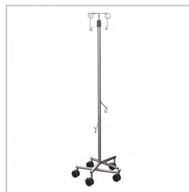
Stacking IV Pole - Premium SS