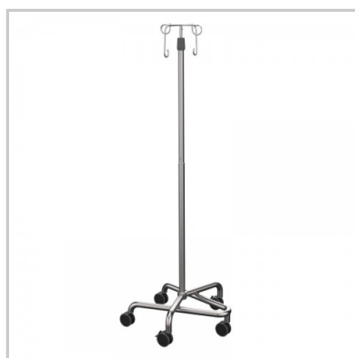
Stacking IV Pole - SS

Australian designed and manufactured, we stock a range of the highest quality metal IV poles with intuitive, smooth operation and the option to customise to adhere to your specifications.