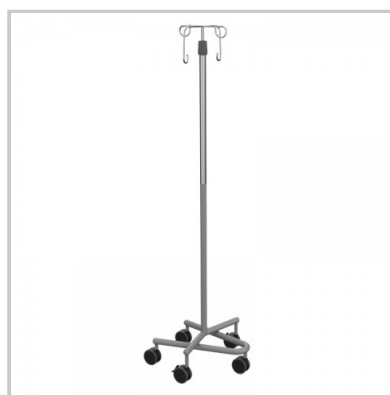
Stacking IV Pole - Premium MS