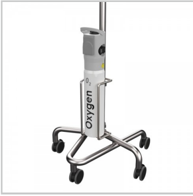
IV Oxy Holder