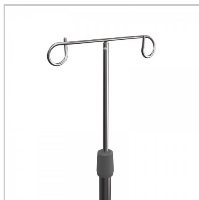
IV Double Hook