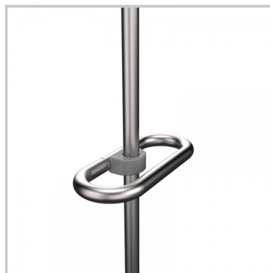
IV Push Handle