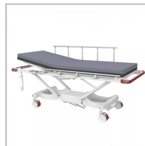
Dropside, cover, colour options