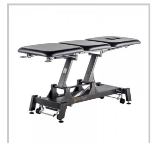
Black - FSET-1003U-65BB