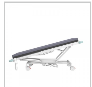
15 degree head and foot tilt