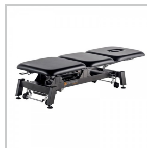
Black - FSET-1003U-65BB