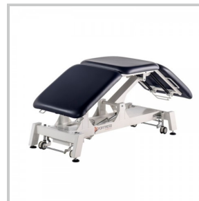
White - FSET-1003U-65WN