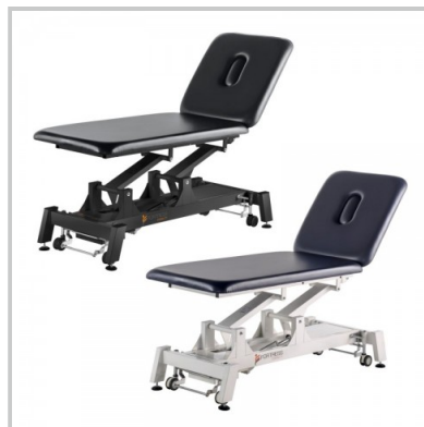
2 Section Exam Table