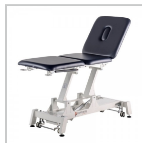
White - FSET-1003U-65WN