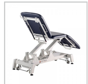
White - FSET-1003U-65WN