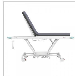
Excellent high height