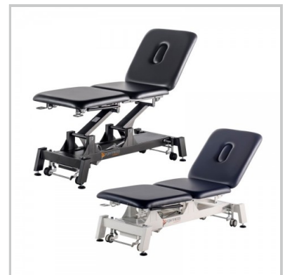
3 Section Exam Table