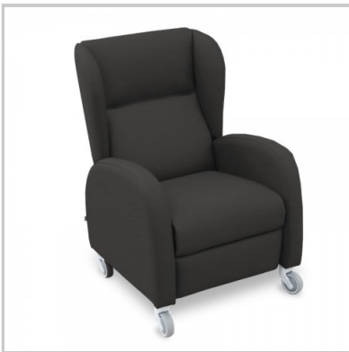
Manual Recline Chair

Long periods of patient care can be eased with the right choice and quality of support seating. We offer a selection of quality comfort chairs to make the recovery process a little bit easier.