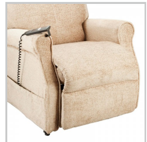
Monarch foot rest detail