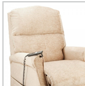
Monarch backrest detail