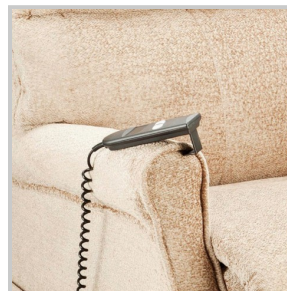
Monarch controller detail