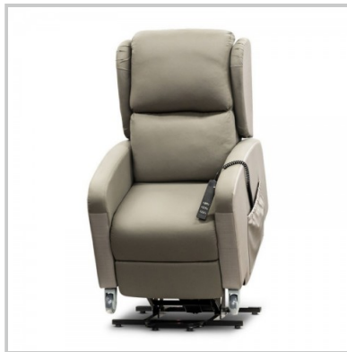
X9 Mobile Power Lift Chair