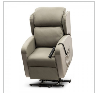
X8 Power Lift Chair