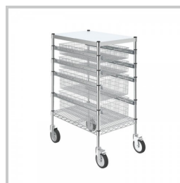
Narrow Wire Basket Trolley 455 W x 680 D x 1030mm H