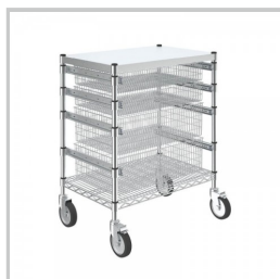
Standard Under Bench Wire Basket Trolley 680 W x 455 D x 880mm H Fits under most standard height benches.