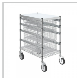
Narrow Under Bench Wire Basket Trolley 455 W x 680 D x 880mm H Fits under most standard height benches.