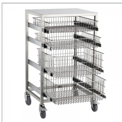
Stainless Sliding Basket Trolley

Transport your goods with lightweight, clean wire-shelf and wire-basket trolleys. If your needs extend outside these products, please get in touch and we can help.