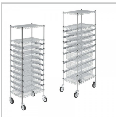
Wire Drawer Units