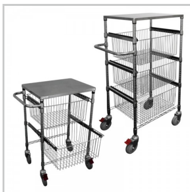
Sliding Basket Trolley