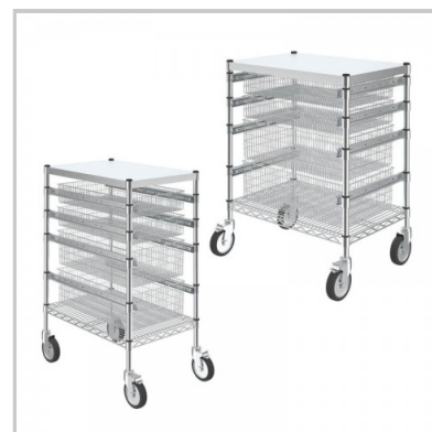
Wire Basket Trolleys