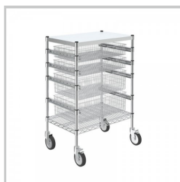
Standard Wire Basket Trolley 680 W x 455 D x 1030mm H