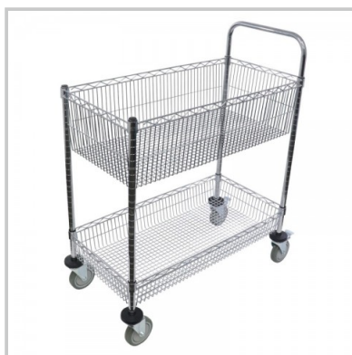
Chrome Basket Trolley