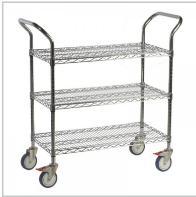
3 Shelf Wire Trolley