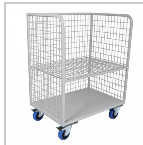
Open Front Mesh with Shelf