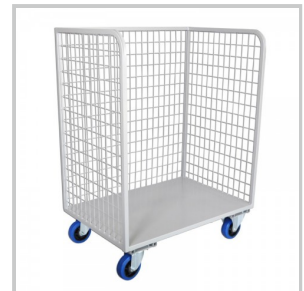
Open Front Mesh