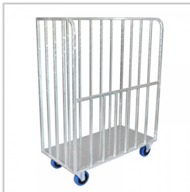
Bulk Delivery Trolley