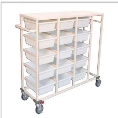
Storage Basket Trolley