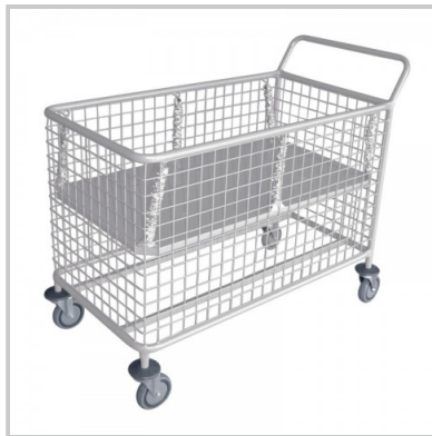
Mesh Linen Trolley