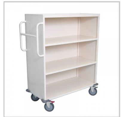
Large Linen Trolley