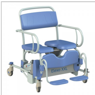
Elexo Bariatric Hygiene Chair - Electric