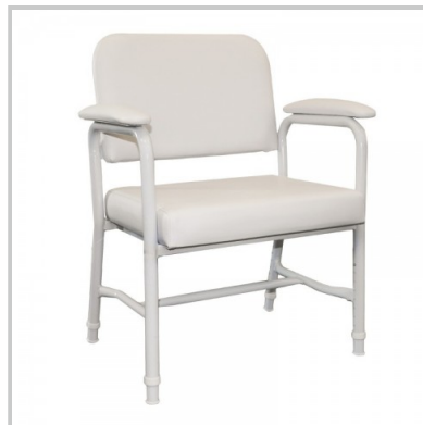
Bariatric Shower Chair