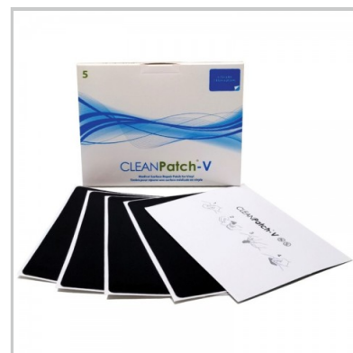
Vinyl Patches - Large