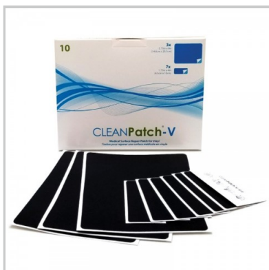
Vinyl Patches - Variety Kit

CleanPatch-V is a medical surface repair patch for vinyl upholstery, which restores damaged patient surfaces on clinical equipment such as chairs and exam tables, to ensure they are completely intact and hygienic.