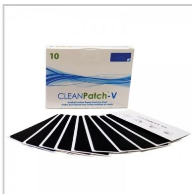
Vinyl Patches - Small