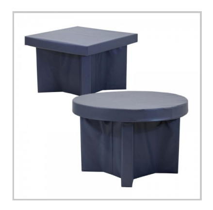
Square Or Round Dining Table