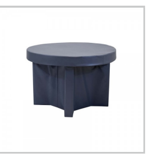
Round Dining Table