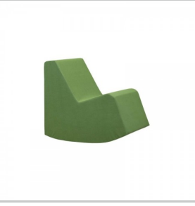
Upright Rocking Chair with Arms