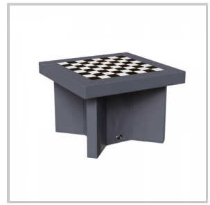
Square Dining Table Chess or Checkers