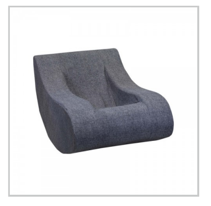
Sensory Rocking Chair