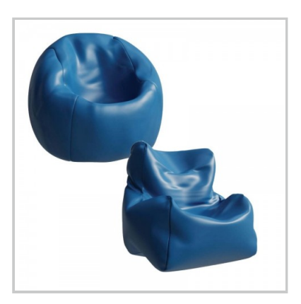
Bean Bag & Bean Chair