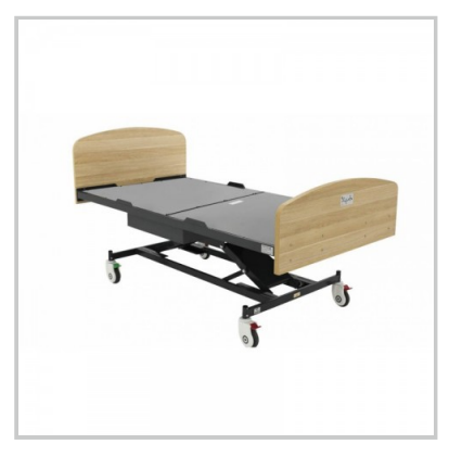
Form 300 Mental Health Bed