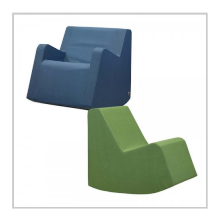
Upright Rocking Chair