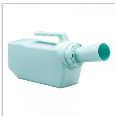
Male Urinal Spill-Proof