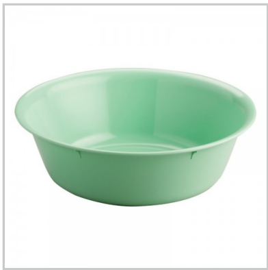
Commode Bowl Economy