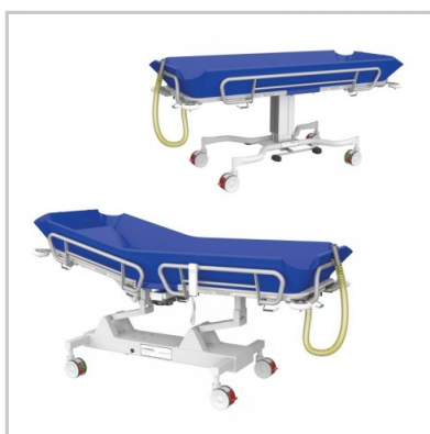
Shower Beds And Trolleys

We understand the challenges involved in helping patients navigate an exposed, wet environment. Our bathroom products put safety first and aim to ease the burden on carers.