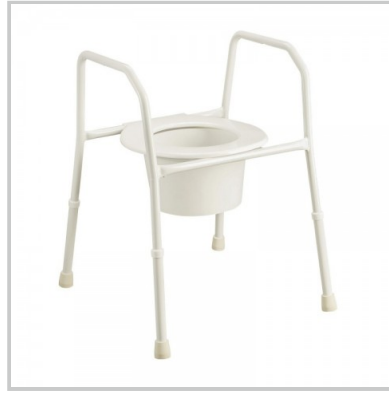
Over Toilet Aid