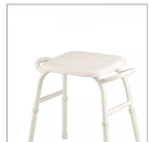
Adjustable leg height