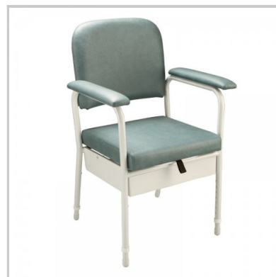
Premium Bedside Commode