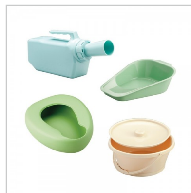
Bowls & Urinals