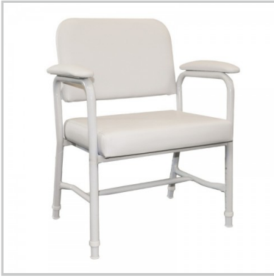
Bariatric Shower Chair