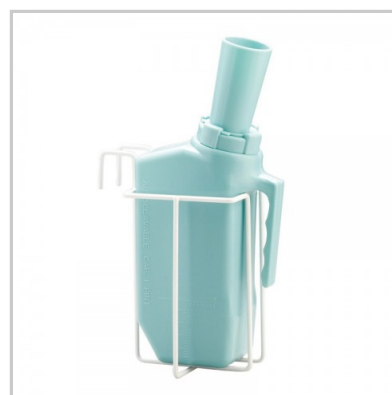
Male Urinal Bottle Holder