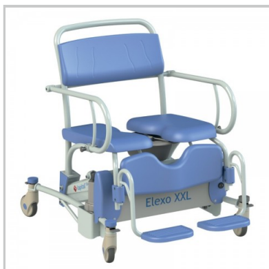
Elexo Bariatric Hygiene Chair - Electric