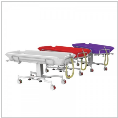
Custom Liner Colours