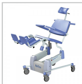
Optional leg comfort supports