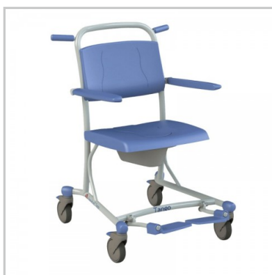
Tango Hygiene Chair

A perfect solution to safely assist disabled persons to use the toilet or shower, offering complete adjustability and generous access to the patient, our hygiene chairs allow for greater independence for both the carer and patient.