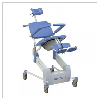
Reflex Hygiene Chair - Electric