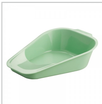
Bed Pan Slipper