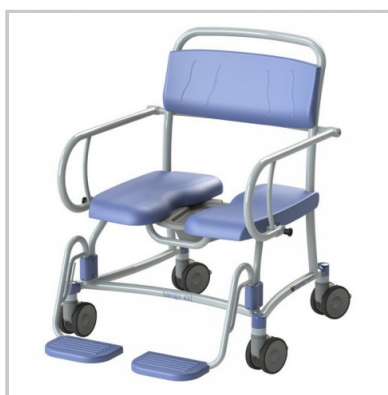
Tango Bariatric Hygiene Chair