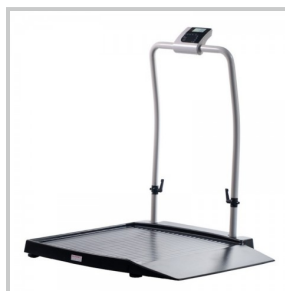
1 Ramp: SCWS-H350-00-2