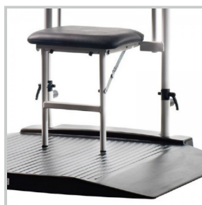
2 Ramps & Seat: SCWS-H350-00-4