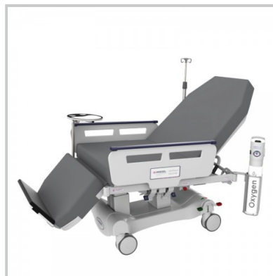
Contour Recline Barituff