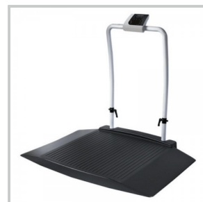
2 Ramps: SCWS-H350-00-3