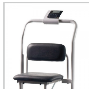
2 Ramps & Seat: SCWS-H350-00-4