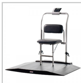
2 Ramps & Seat: SCWS-H350-00-4