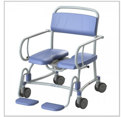
Tango Bariatric Hygiene Chair