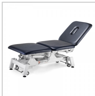
Three Section Exam Table - Bariatric