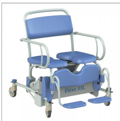
Elexo Bariatric Hygiene Chair - Electric