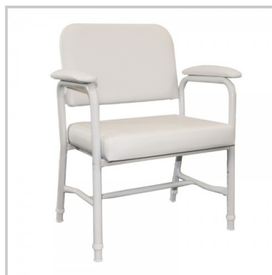
Bariatric Shower Chair